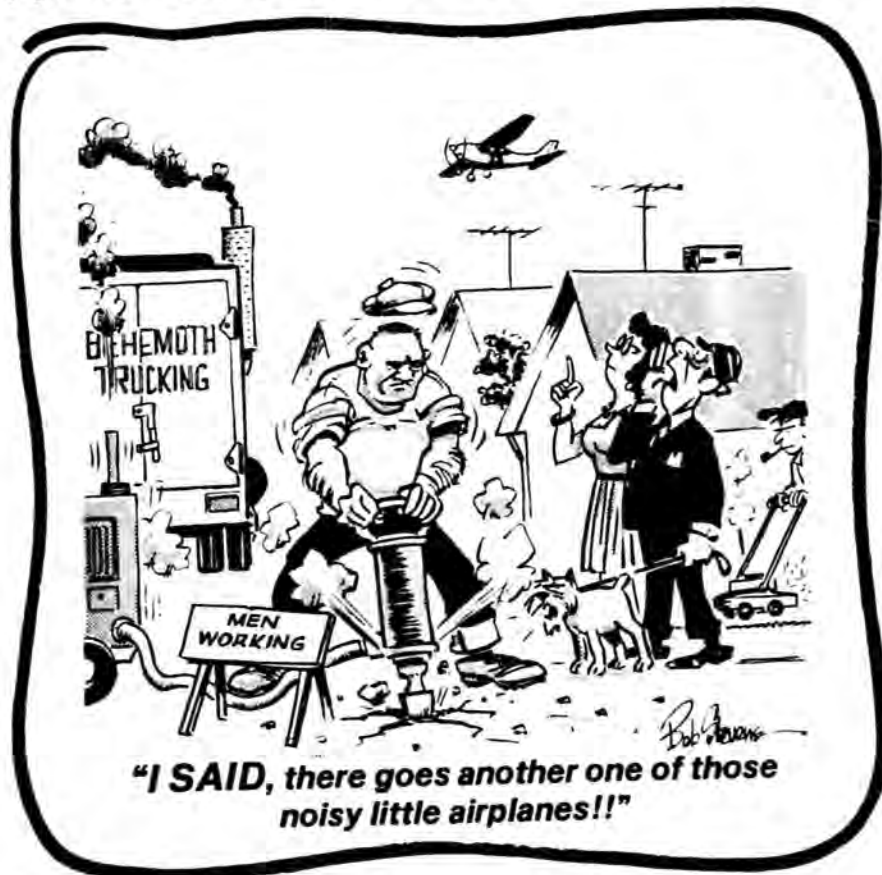
"I SAID, there goes another one of those noisy little airplanes!!"